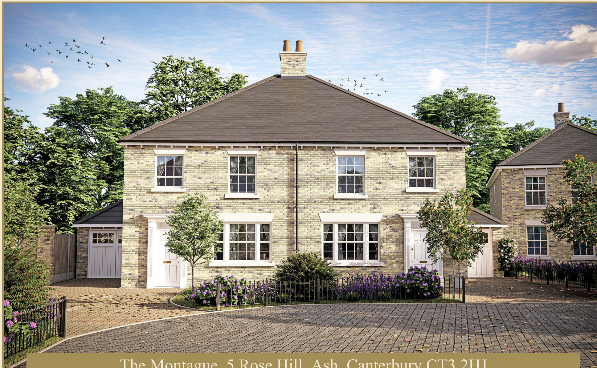
The Montague, 5 Rose Hill, Ash, Canterbury CT3 2HJ